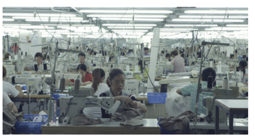
Still: "Ascension"/Field of Vision

Projects supported by Field of Vision illuminate and impact the world around them. Many premiered at top-tier film festivals around the globe and were nominated for or won prestigious awards in 2021. 2021 also marks the sixth consecutive year when Field of Vision-supported films were shortlisted and/or nominated for an Academy Award. Impressively, seven Field of Vision films had their broadcast premiere on television's longest-running showcase for independent nonfiction film, POV on PBS.