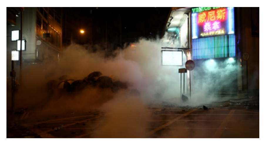
Still: "Do Not Split"/Field of Vision

government backlash, the passage of the new Beijing-backed national security law, and the protests that captured the attention of the world. After the Academy Award nomination, censors in Hong Kong were given the power to vet films that authorities said may endanger national security. The Chinese government censored coverage of the Academy Awards, and a major Hong Kong broadcaster dropped the broadcast of the awards ceremony entirely.