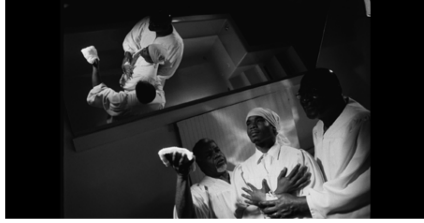
Still: "America"/Field of Vision

AMERICA by Garrett Bradley is a cinematic omnibus rooted in New Orleans that challenges the idea of Black cinema as a "wave" or "movement in time," proposing, instead, a continuous thread of achievement. Inspired by the earliest surviving feature-length film with an all-black cast, Bradley conjures a series of stunning black-and-white vignettes of joy, domesticity, and triumph.